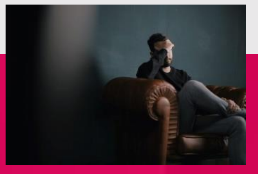
Manage WHS/Psychosocial Risks

Counter complaints need to be dealt with separately with allegations